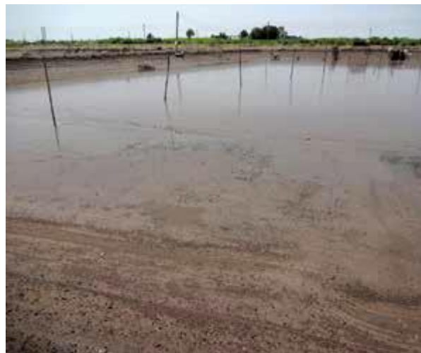
Trial pond after harvest – no sludge