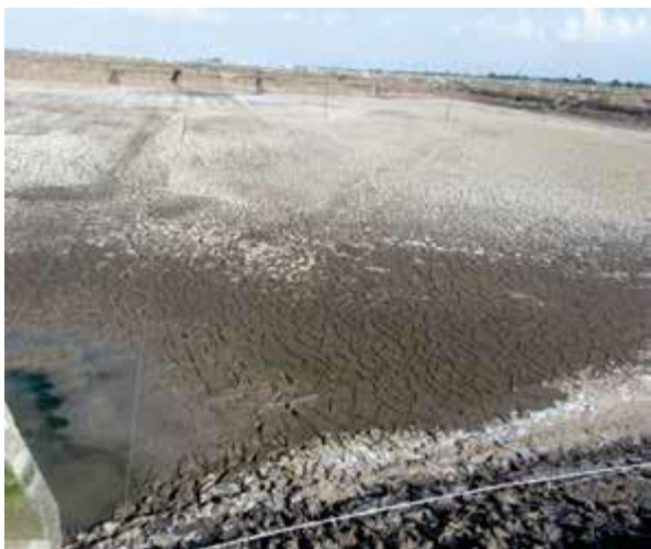
Sludge after harvest in all control ponds